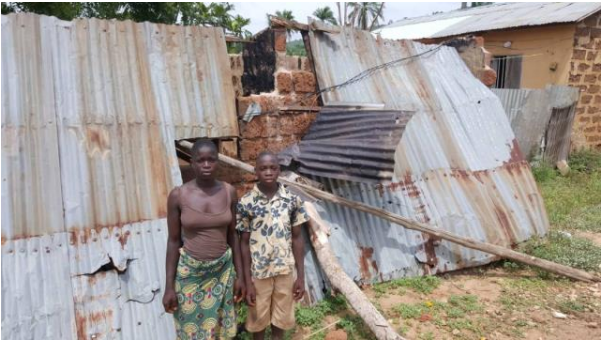
The house of one of our foster families after the floods. It was promptly repaired thanks to your support.

During the spring period, massive floods affected the country and caused damages to the houses of some of the foster families. We were able to cope with such emergency situations by providing an exceptional support.