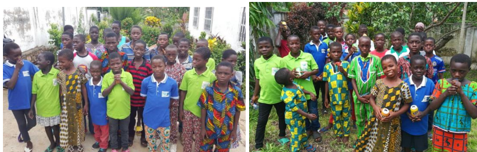
Children meeting every month ...

What matters most is that we never gave up fighting to help the children. We could do it thanks to you, as you have ceaselessly trusted and backed us. In 2018, before being able to recover our orphanage following legal proceedings, we could with your support rent a house. It allows us each month, on the occasion of festive events that we organize, to welcome all the children that we have managed to place in foster families . In this way we can keep regular contact with the children and continue to support them at all levels, including psychologically. Thanks to you we can also give foster families a financial support for the children every month. In particular, we could be with the children at the time of the start of the school year as well as Christmas celebrations when we organized a beautiful festive event for them.