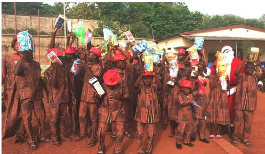
Children celebrating Christmas (above) and festive event for the widows we are supporting (below)