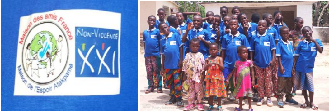
A memorable training for the children, the families and the instructors.

Additionally, let us mention that we could organize training sessions on educative non-violence designed for the foster families and also the children. It was a great time for the sense of sharing and dialogue. We are grateful to the Non Violence 21 Foundation which made it possible to organize it.