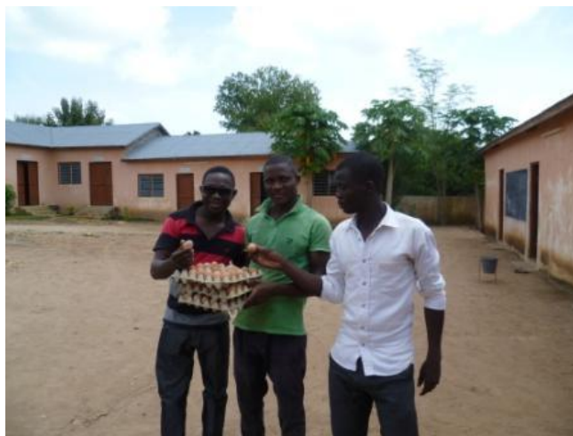
Daily egg trays thanks to the agricultural and breeding programme