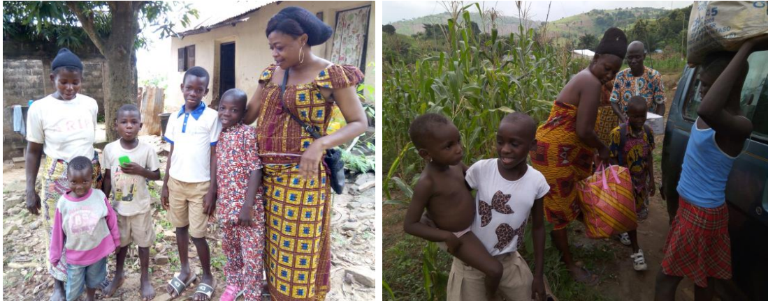
Children returning to the home of family members