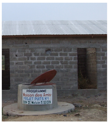
The works progress quickly: here, the roofs of the boys'bedrooms were built in a few days only