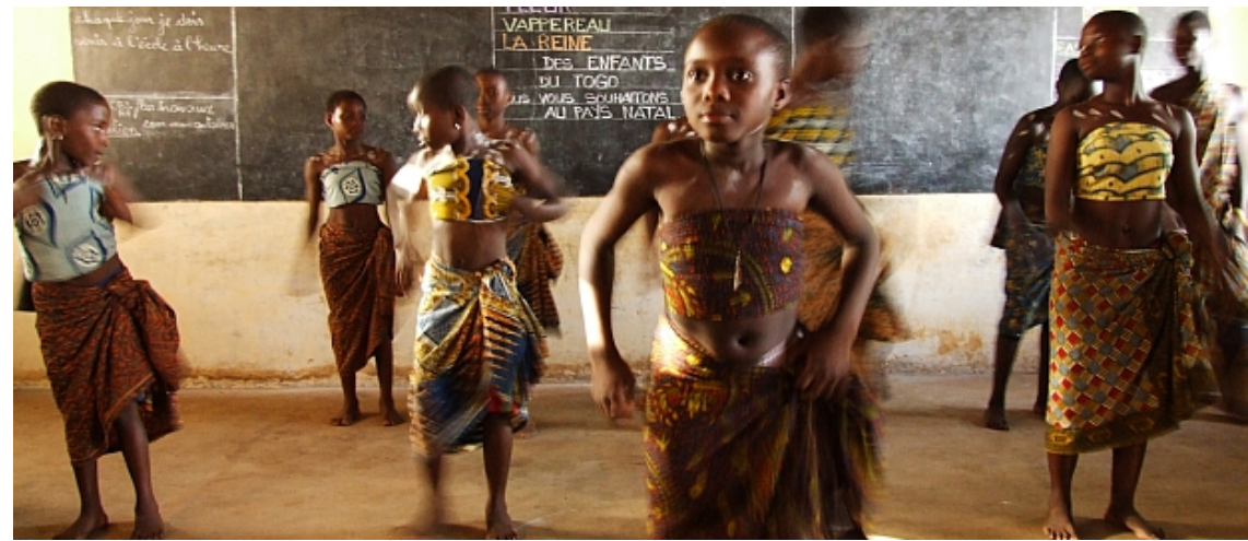
Dancing show at SADA primary school

In their foster families: we have been visiting many foster families. Some of our sponsors had sent us presents to give to the children they support: that's why we started by the families taking in those children. We wish to thank the sponsors for their kindness that was much appreciated. We also thank the foster families for all their efforts and love: some of them take up to four orphans! But we noticed that despite the help brought by our programs, the economic conditions of some of these families are alarming. We need to take a stand and act to fight such dire poverty!