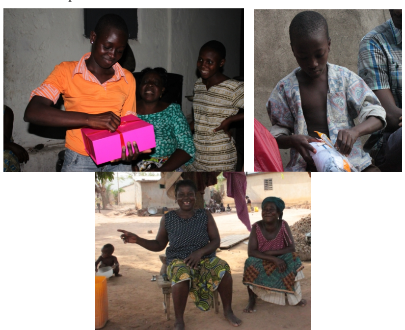
Offering presents given by the sponsors to the children and visiting foster families

Let's keep in mind that we currently support more than 300 children through all-inclusive programs (school fees, food, medical care, clothes, psychological support) or partial programs (school fees, books and school uniforms). About a quarter of our 300 children are infected with HIV-AIDS and thus need special care and attention.