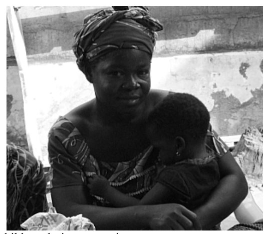
Our widows and their children during a meeting

Considering the difficulties these women go through, we have taken the following decisions: