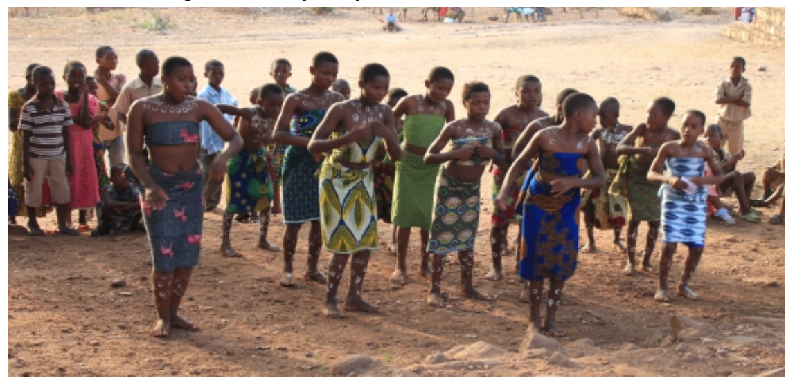
Singing show at Doulassamé primary school

In their foster families: we have been visiting many foster families. Some of our sponsors had sent us presents to give to the children they support: that's why we started by the families taking in those children. We wish to thank the sponsors for their kindness that was much appreciated. We also thank the foster families for all their efforts and love: some of them take up to four orphans! But we noticed that despite the help brought by our programs, the economic conditions of some of these families are alarming. We need to take a stand and act to fight such dire poverty!