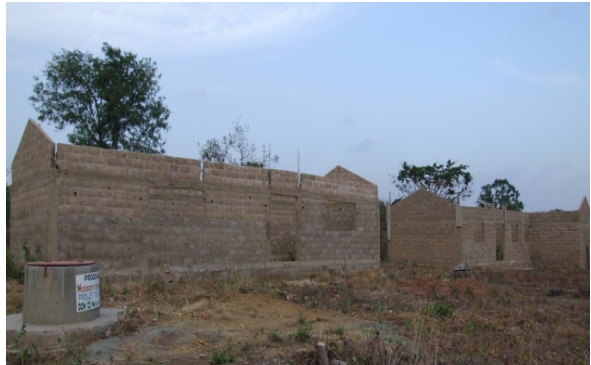
The walls of our youth hostels and one of our two water wells