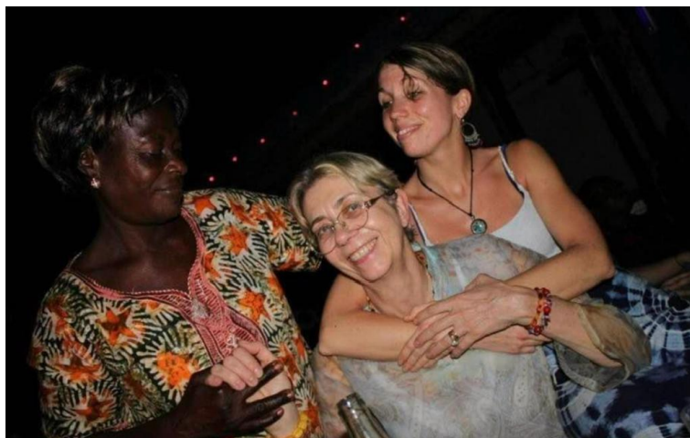
Visit to Togo in 2013