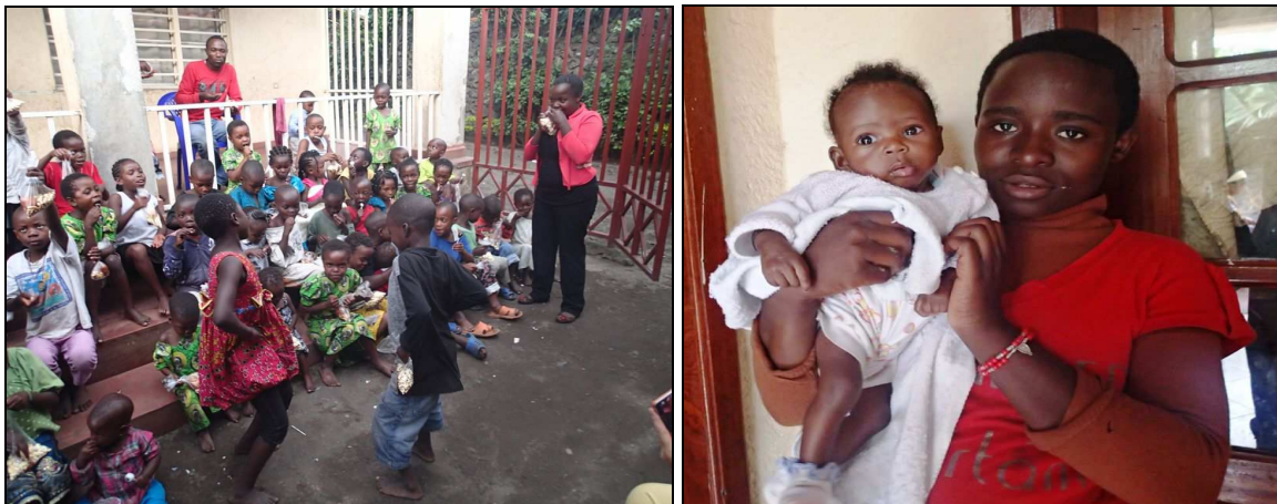
Children and a young woman with her baby in the welcome centre, © Vivere

Our partner currently welcomes 20 single mothers and 95 children in its centre. The number of children considerably exceeds the capacity of this small centre that we intend to support. In Congo, this type of initiative must continue to be supported decisively. Considering the geopolitical situation of the country, the sufferings of the civilian population, this is an absolute need in our view.