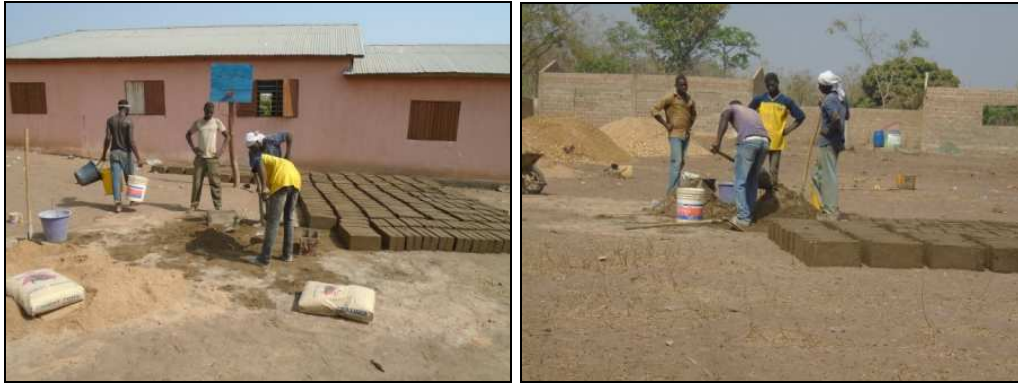
Start of the building work for the hen house and the enclosure for the goats.

We have already started to build the hen house and the enclosure for the goats. We have to wait until the next wet season to start cultivation.