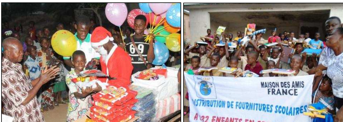
Christmas and new school year celebrations for our sponsored children.

Let's keep in mind that the sponsorships are the basis of our activities which we developed right from the start, even before our orphanage was built. We wish long life to our children sponsorship programme !